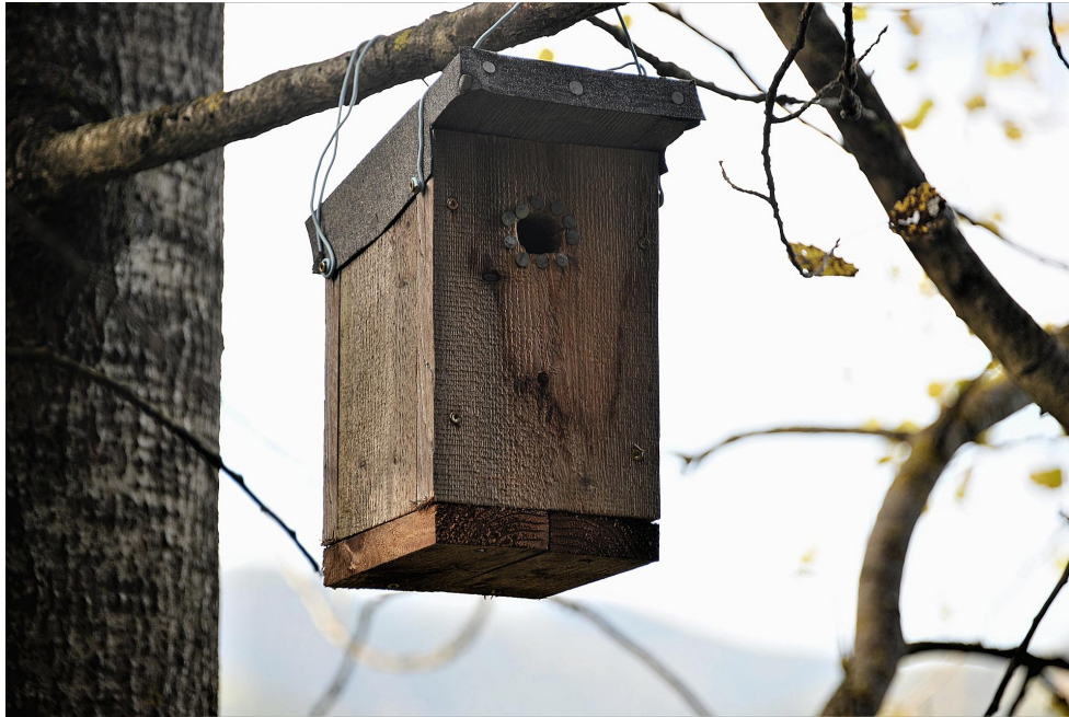
This bat house helps protect bats from predators.

Many bats are endangered . You can help protect bats by building a bat house to keep them safe.