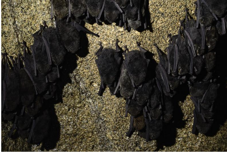
This bat colony lives in a cave.

Some bats live in caves. They hibernate , or sleep, in winter. They often live in large groups called colonies .