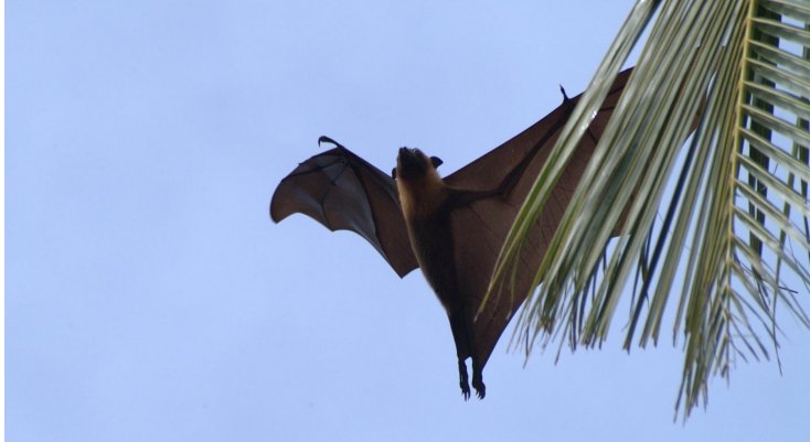
A flying fox takes to the skies.

The smallest bat, called the bumblebee bat, lives in Thailand. It weighs less than a penny.