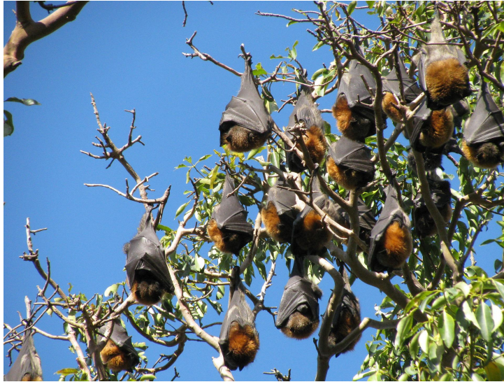
These bats sleep upside down.

Most bats sleep upside down. This makes it easier for them to take-off and fly. When they want to fly, they can just let go and swoop into the air. Sleeping upside down also helps them avoid predators.