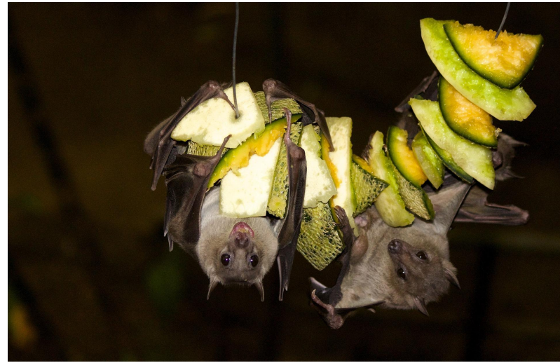
These bats are enjoying some cut fruit.